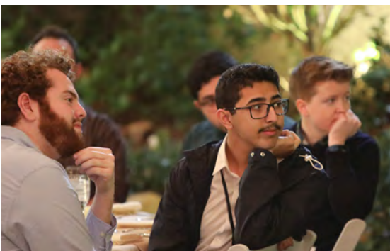
Opposite Page Top: Medicine, Health, and STEM LEAD attendees.