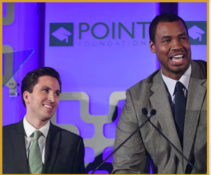
Above Left: Jussie Smollett.