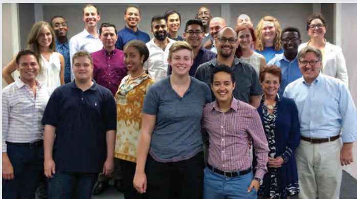
Point Scholars, alumni, board and staff attend the Business, Consulting & Finance LEAD Consortium.