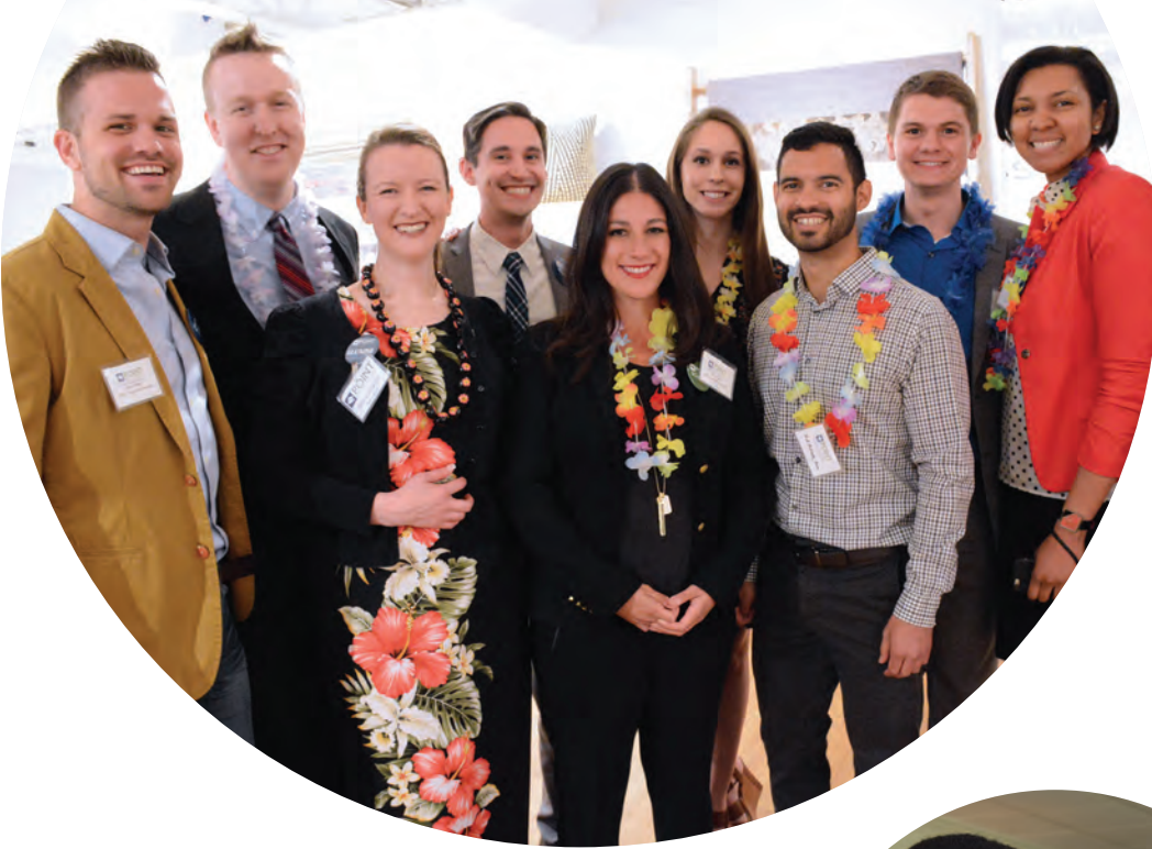
Above: Point Alumni at the 2015 Washington D.C. Cornerstone.